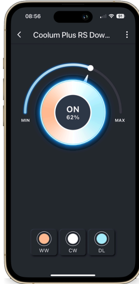
Dim and colour tune / select