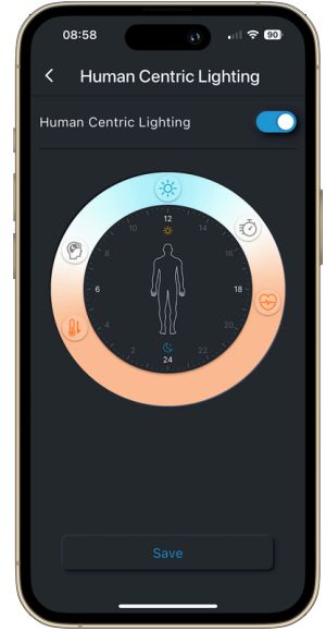
Activate Auto-HCL Mode*

*Auto HCL mode selects the ideal light colour for time of day when operating. HCL function requires PIXIE Gateway SGW3BTAM