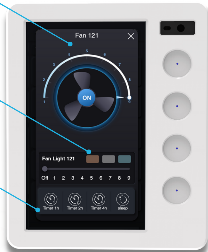
PIXIE TOUCH PANEL PART#:STP54BTAS

Operate comfort timers minimising energy usage automatically