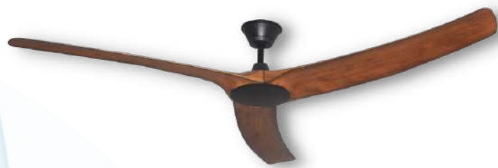
Aqua IP66 V2 Matt Black with Koa Blades 70" No Light - AIP2666