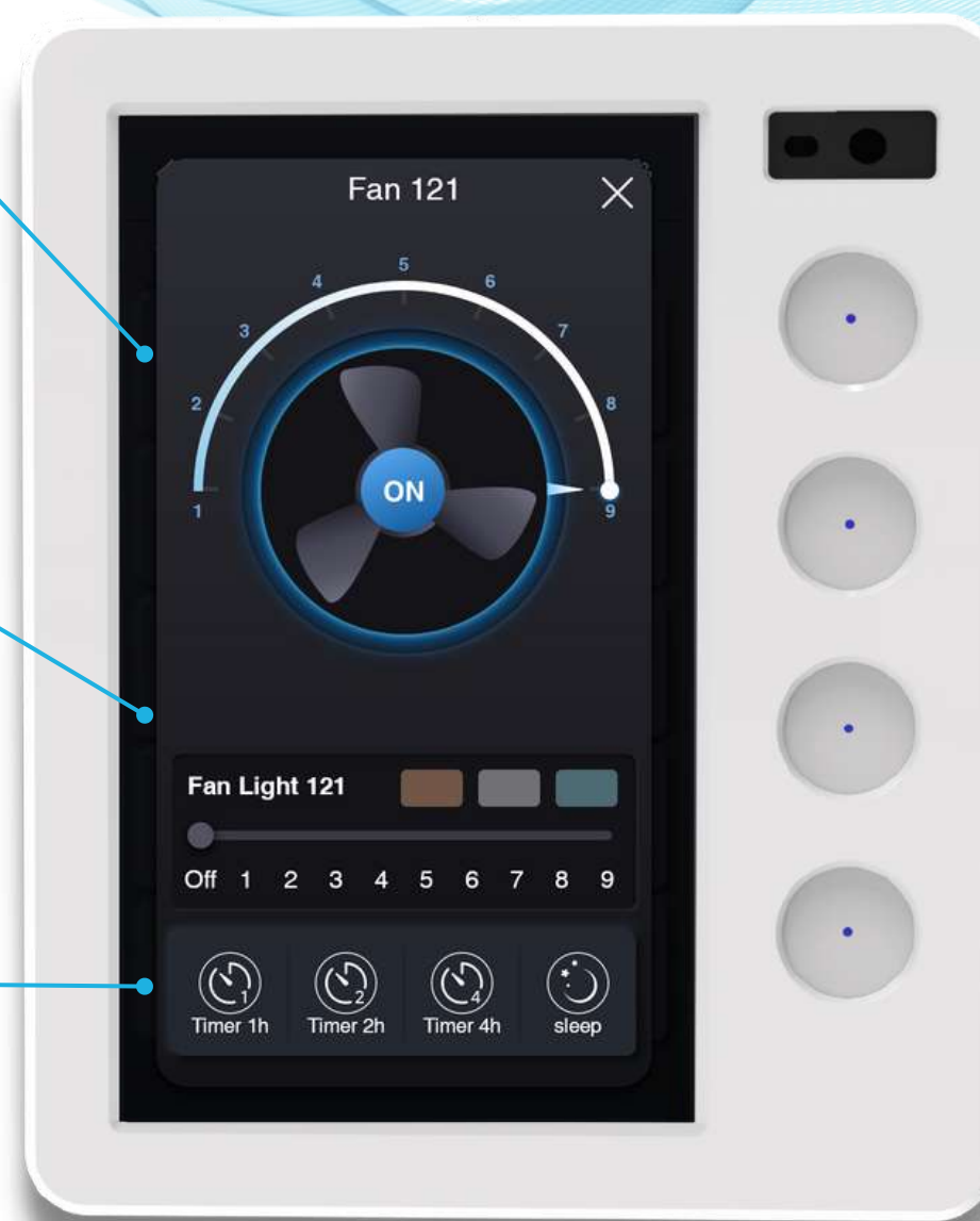
PIXIE TOUCH PANEL PART#:STP54BTAS

Activate timers to maximise comfort whilst automatically minimising energy usage.