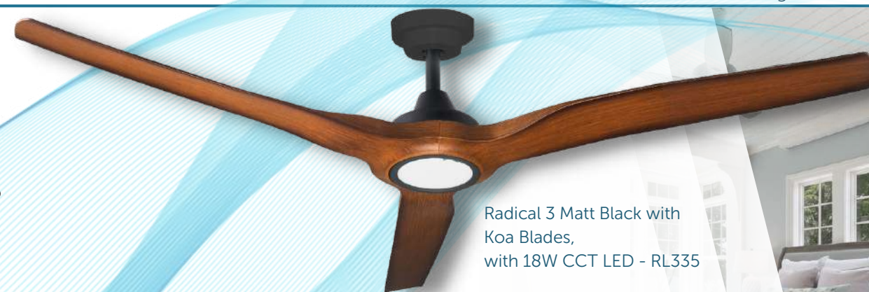
Radical 3 Matt Black with Koa Blades, with 18W CCT LED - RL335

6 & 9 Speed fan control with intuitive dial interface with animated fan graphic for simple user speed feedback.