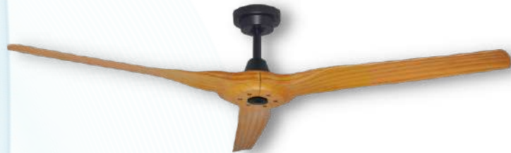
Radical 3 Matt Black with Bamboo Blades - R324