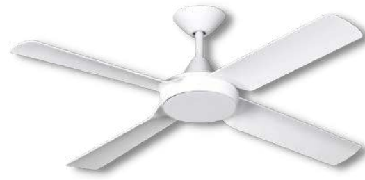
New Image V2 White with 18W CCT LED Light - NIL2105