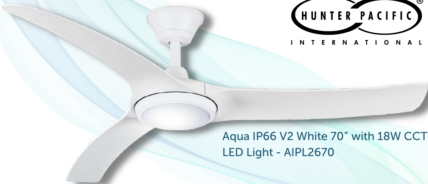
Aqua IP66 V2 White 70" with 18W CCT LED Light - AIPL2670