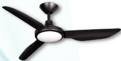
Polar V2 48" Matt Black with 18W CCT LED Light - P3BL2582