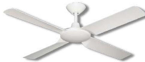
Next Creation V2 White No Light NC2151