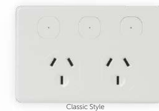
Cover Type 2 SPO23/CW/BTP