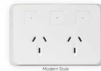
Cover Type 3 SPO23/IW/BTP