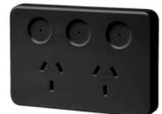
Faceplate SPO23AB/BTP Matt Black Round, sunken buttons