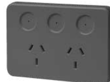
Faceplate SPO23AG/BTP Matt Gray Round, sunken buttons