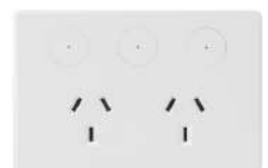
Faceplate only SPO23EW-BTP White only

Styling characteristics appeal to homeowners who like modern faceplates.