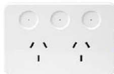
Faceplate Included Gloss White Round, sunken buttons