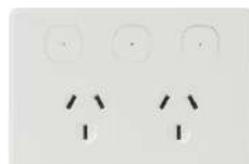
Faceplate only SPO23CW-BTP White only

Styling characteristics appeal to homeowners who like classic faceplates.