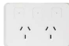
Faceplate only SPO23IW-BTP White only

Styling characteristics appeal to homeowners who like classic faceplates.